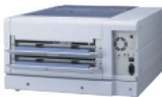
UP-DF550 Rear Panel

Available from: SST Group Inc. 309 Laurelwood Rd. Suite 20 Santa Clara, CA 95054 800-944-6281 408-350-3100 (fax) www.sstgroup-inc.com sales@sstgroup-inc.com