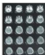
Multiple Film Sizes

Design and specifications are subject to change without notice.