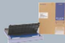
UPT-517BL Media (14 x 17") Blue Thermal Film Printing Pack Contents: 125 sheets per pack